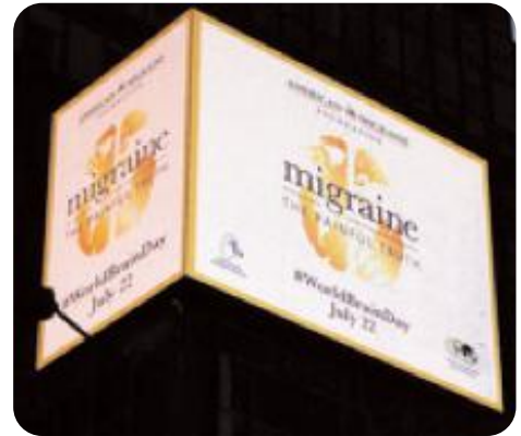
New York Times Square billboard

We invite all IHS member societies, neurologists, neuroscientists, trainees, technologists, advocacy organisations and patient advocates to be part of World Brain Day's 'Migraine: The Painful Truth' campaign. You can participate by posting our banner advert on your webpage, and by sharing our posts, messages and videos with your friends and colleagues. You can also partner with local neurology, headache and advocacy organisations to participate in and promote these activities. Promotional material and a press toolkit to help with press contacts and mailing are available on the World Brain Day website .