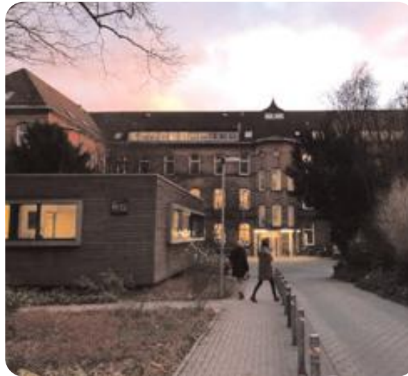
Universitätsklinikum Hamburg Eppendorf (UKE)

The IHS fellowship will be a highlight in my resume when I apply for future grants and continue my headache research