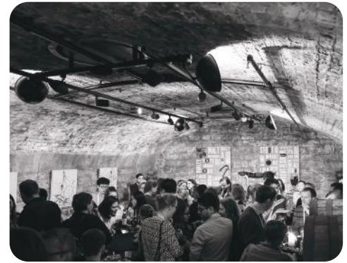
Juniors forum, Urban Brewing