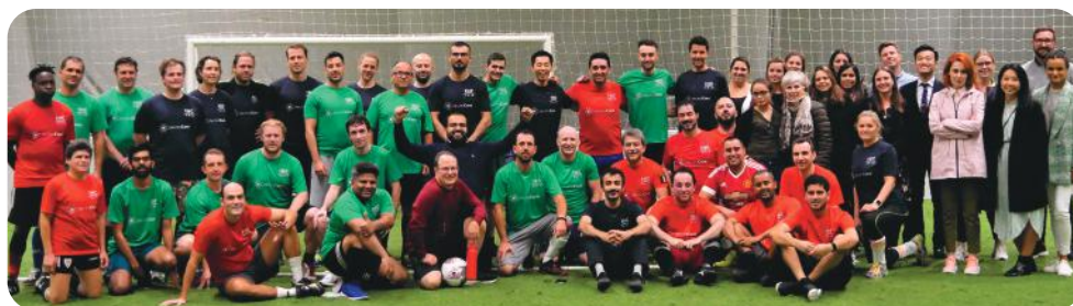
Headache World Cup