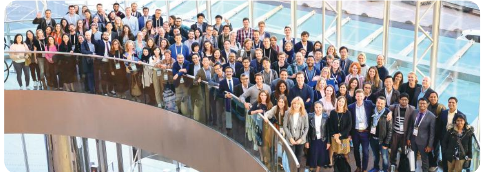
Junior delegates in Dublin Convention Centre