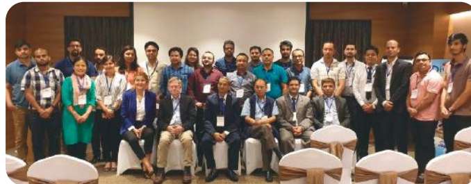
Group photo at the end of the program: guest speakers, NAN members and delegates

The IHS Visiting Professor programme not only provided us with knowledge in the field of headache diagnosis and management, but also guided us to initiate multicentre or community-based headache studies in Nepal